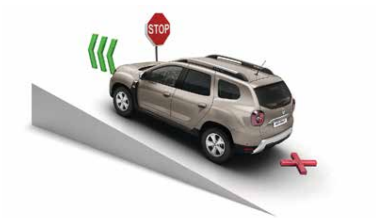
(HSA) Hill Start Assist. Starting the car on steep slopes is no longer a worry. When you take your foot off the brake, hill-starting assist takes over and holds the vehicle steady for two seconds. This gives you time to accelerate normally without stalling or rolling back.