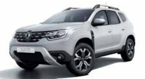
PLATINUM SILVER (MP)