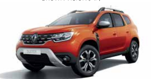
ARIZONA ORANGE (MP)