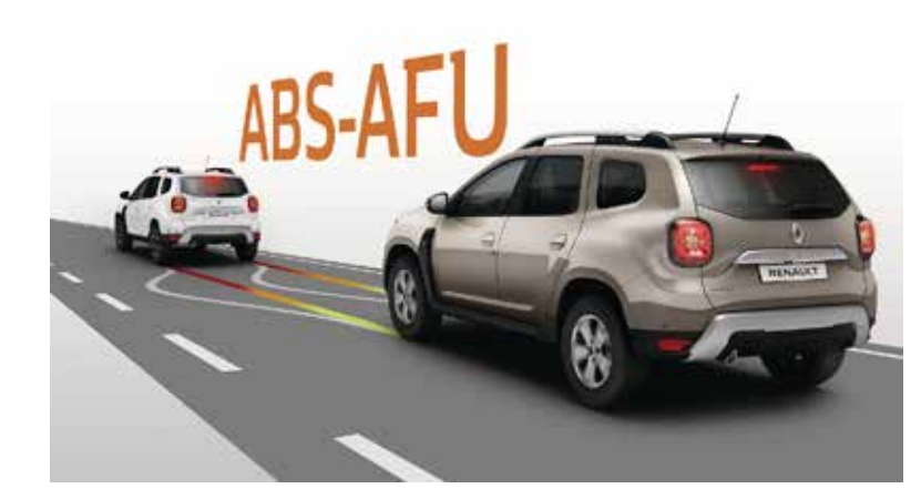
(ABS) Anti-lock Braking System with (EBD) Electronic Brake Force Distribution, in conjunction with (EBA) Emergency Brake Assist: makes it possible to maintain control over the trajectory in the event of heavy braking.