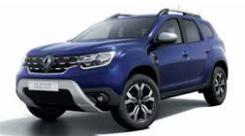
COSMOS BLUE (MP)