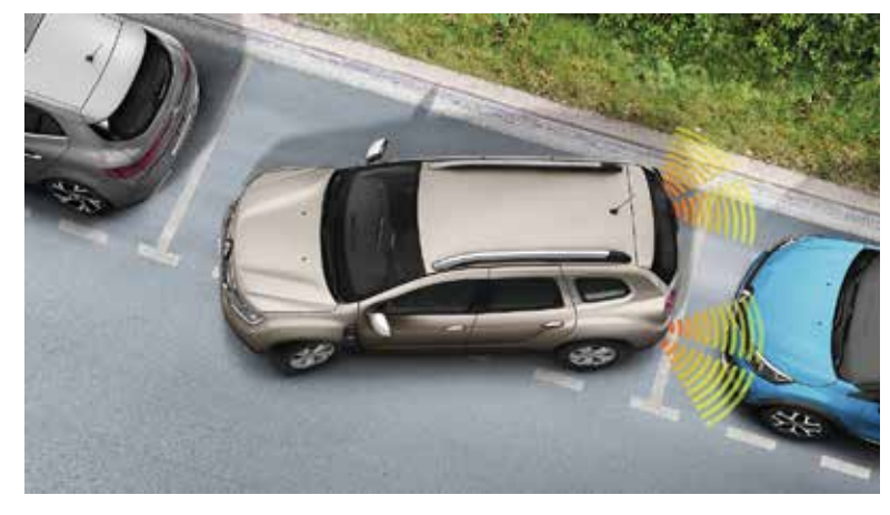
Rear Park Distance Control. To make parking manoeuvres easier. The parking distance control system warns you of obstacles situated behind the vehicle by a sequence of beeps which speed up the closer you are to them.