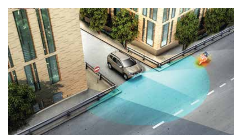
MultiView Camera.* Connected to the Media Nav system, the MultiView Camera shows the images from Duster's four on-board cameras. It is triggered by reverse gear or by a simple touch of the dedicated button. *Standard on 4x4 and Intens model