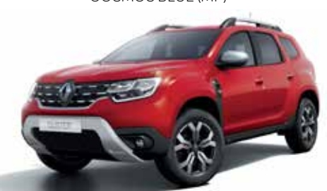
FUSION RED (MP)