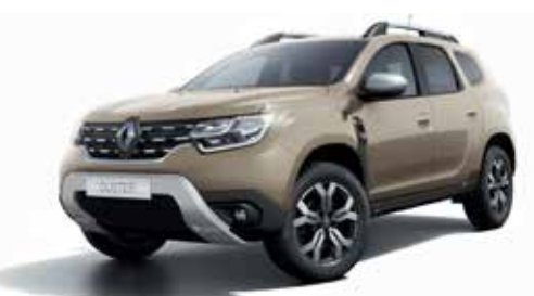
DOMANIA (ICIONI (MD)