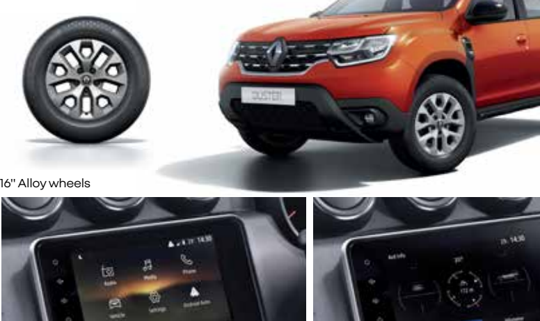
Media Nav with Apple CarPlay® and Android Auto® 4x4 Monitor