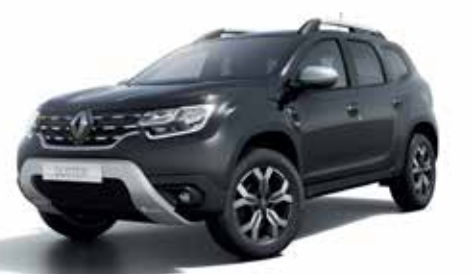
COMET GREY (MP)